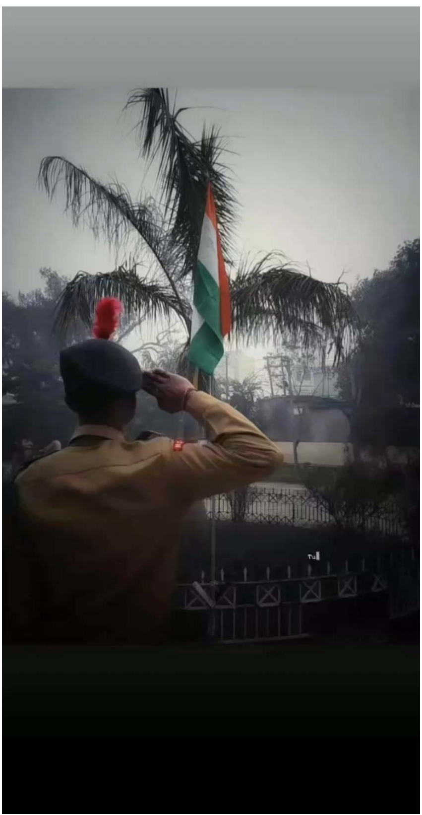
Cadet Saluting, thus pays respect to Indian flag.