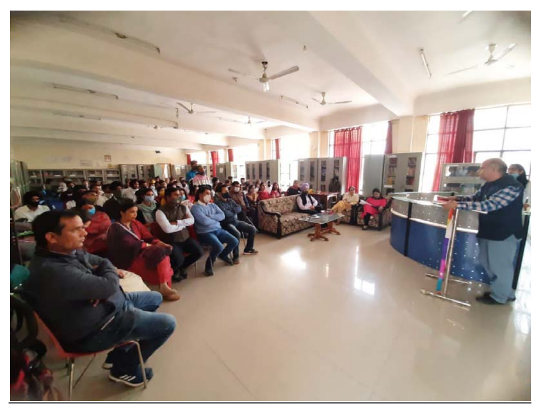
<u>Principal GDC RS Pura, exchanging views with staff members and students on the</u> <u>occasion of women's day.</u>