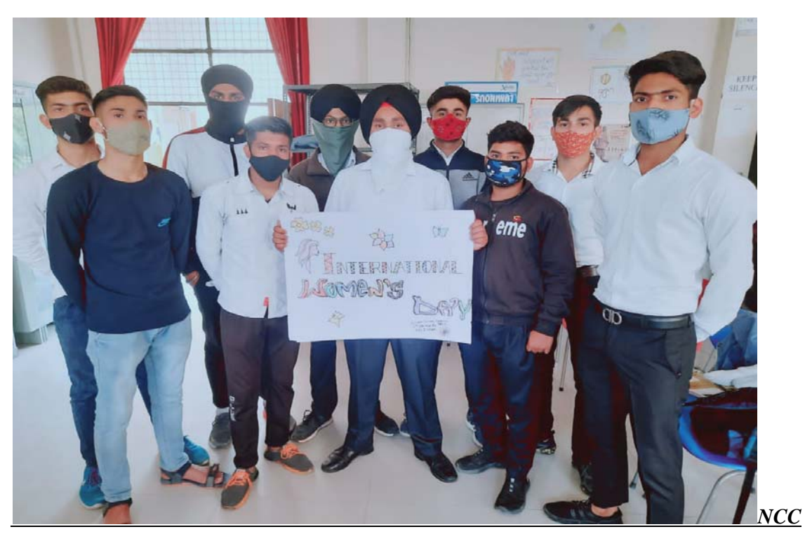
Cadets taking full participation on women's dayby making various posters