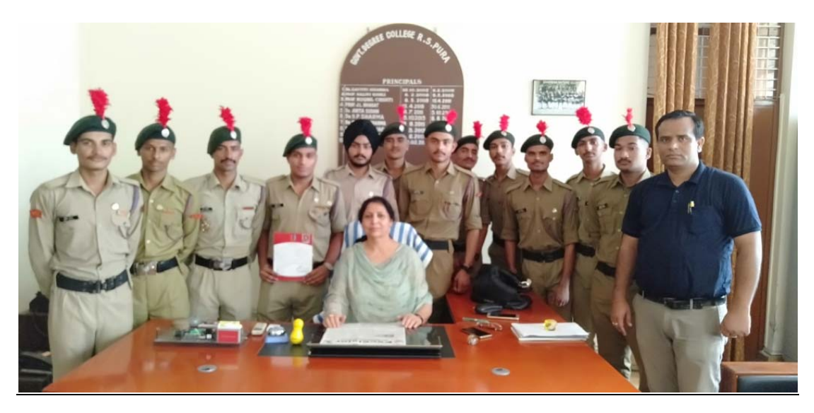
Principal and ANO NCC giving the respective ranks as per Cadets performance