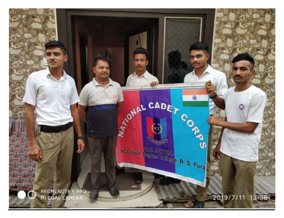
<u>NCC Cadets going door to door in the village to spread information and exchange words</u> with the locals of about cleaning importance, benefits and other important aspects.