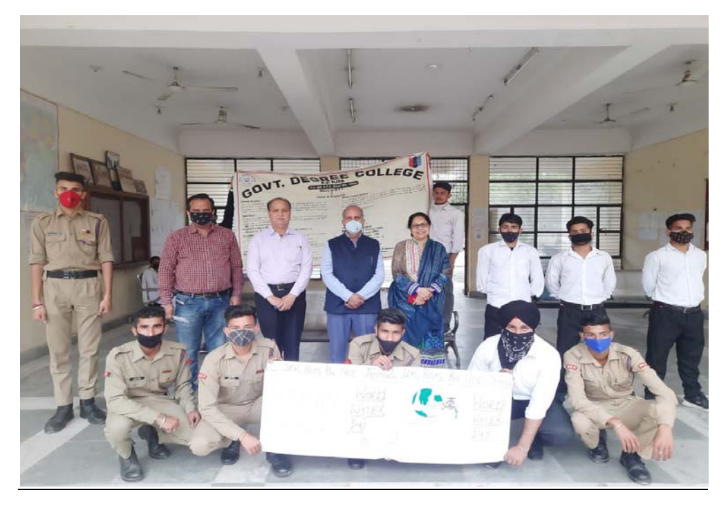
<u>NCC</u> Cadets spreading awareness inside and even outside the college about the water management by making charts and conducting rallies with the help of Principal Sir, ANO Sir and other head staff members