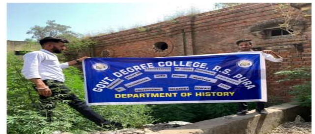
Awareness rally on conservation of local Historical Monuments