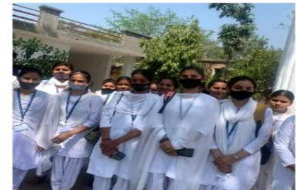
Visit to Locals Temples to study Dogra Architecture.